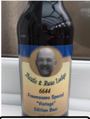
Last season's gift